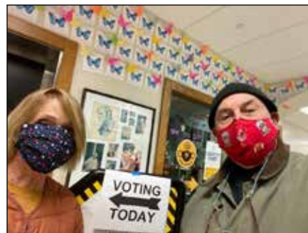
On the frontlines of Election Day 2020

system, its ability to manage every contingency, and train even the most novice of volunteers (which we were)! Like the health of our people, the health of this democracy is in the hands of professionals. For us, the Franklin County Board of Elections was a source of reassurance that in spite of months of political bickering, baseless statements, false news and threats of fraud, the system works. I ven-