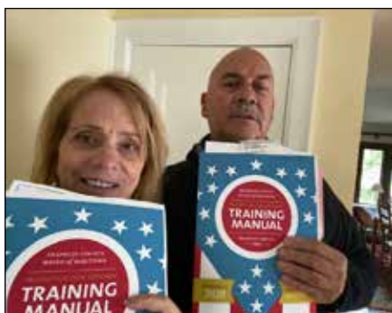
Headed to poll worker boot camp.

The first thing that strikes you about the poll-people is that this is citizen-soldiering in peace time. People of every persuasion, color, age and economic appearance work our elections. We joined retirees, single parents, homemakers, teachers, veterans and persons with disabilities – learned with them and were taught by