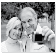
Practice Appraisals & Sales