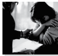
Practice Protection Plan